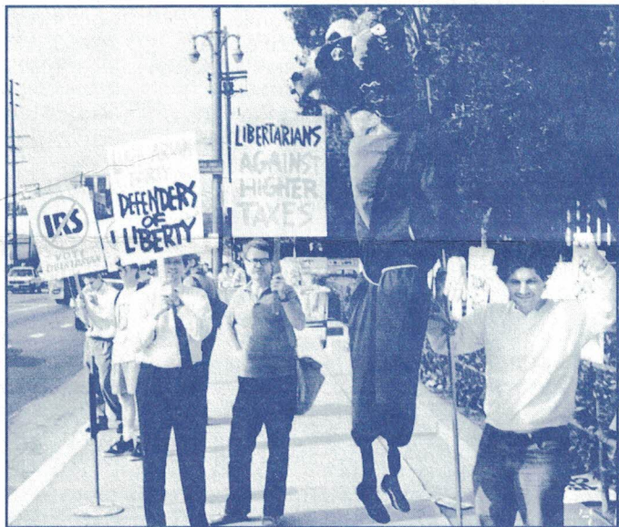
On April 15, Libertarians throughout California demonstrated against the income tax. In Los Angeles, a two-headed monster representing the Democrats and Republicans was hung in effigy.